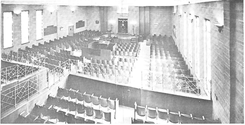
The Bimah in Center