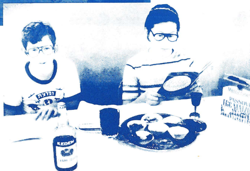
Top to bottom: Recess fun. Pre-primary students study "Sam" the anatomy model. At the Model Seder.