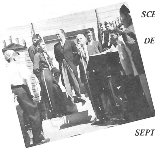
SCENES FROM OUR DEDICATION

Following a short program, the "first earth" was turned with special gilded shovels. Those attending were given miniature metal shovels, specially inscribed as mementoes of the significant occasion. With the aid of G-d and the assistance of our members, there is hope of completing the new building so that it can be occupied for Passover.