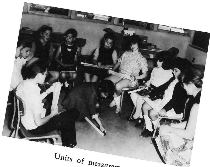
Units of measurement